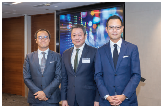
Hong Kong Conference 2019 - IPO Sponsors and Regulations