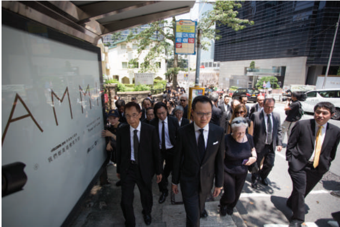
Silent march on 08 August 2019